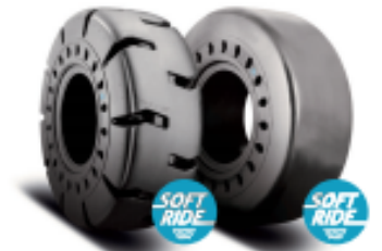
HPS Solidflex Traction