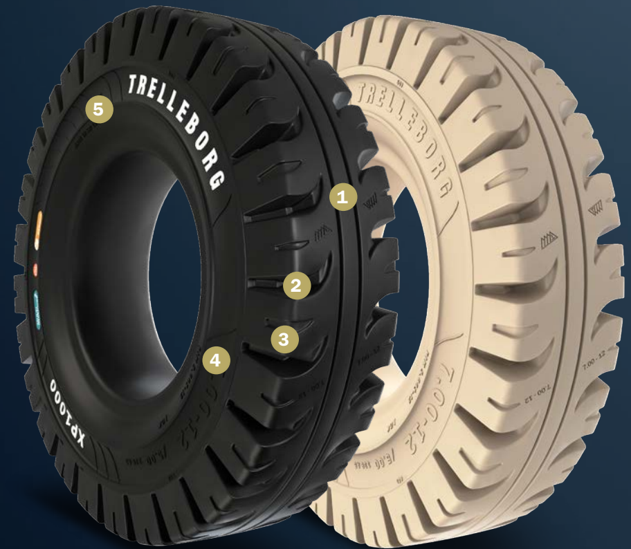
Patented pattern design